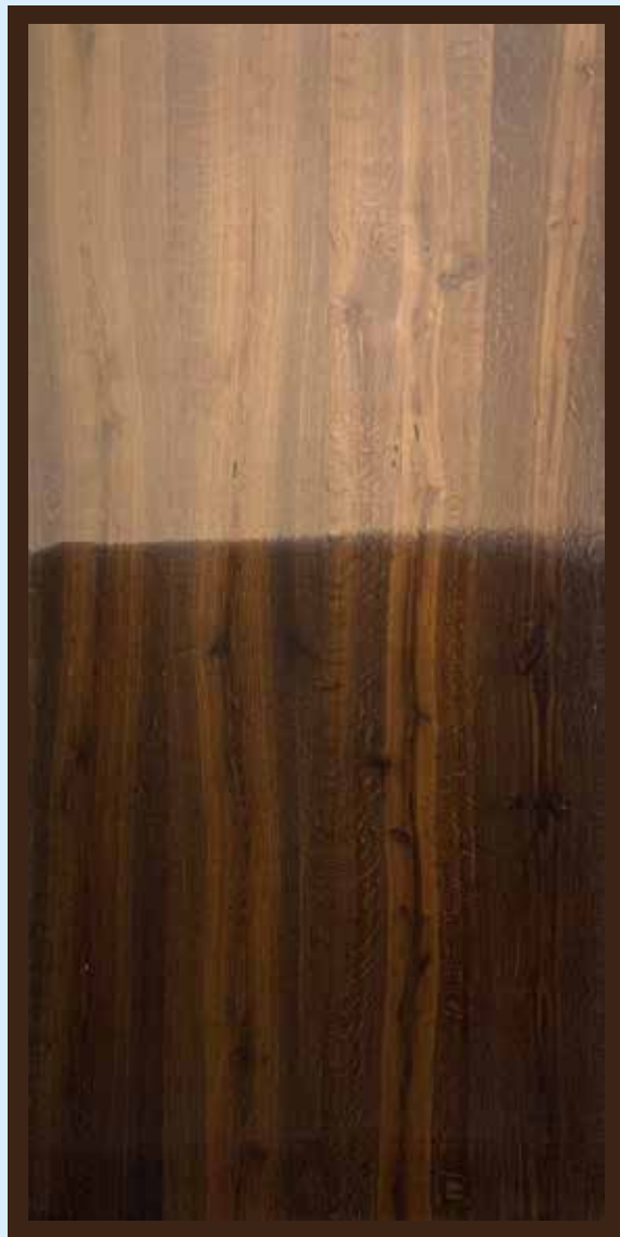
Refuel Crack Oak