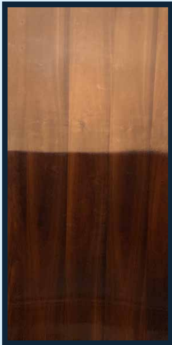
American Berry Crown