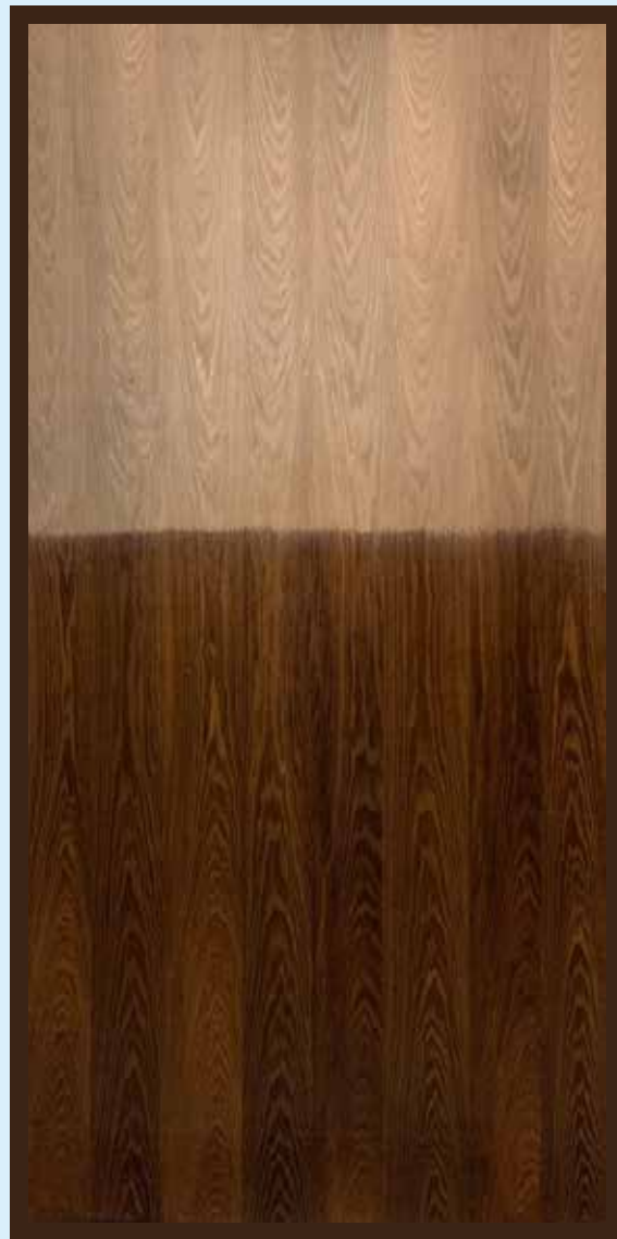
Royal Oak Crown